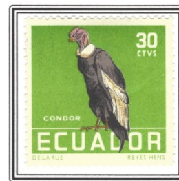
The Andean Condor symbolizes courage and strength. It's also the national bird of Bolivia, Colombia, & Chile