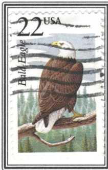
The Bald Eagle was selected in 1782 as a symbol of liberty, courage, and strength.