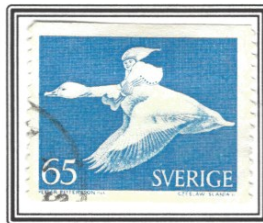
This issue celebrates the "The Wonderful Adventures of Nils" a classic Swedish children's book.