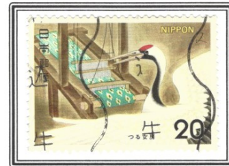
This issue celebrates Tsuru Nyōbō (Crane Wife), a folktale about a man who helps a crane.

Three species have the word "Canada" in their name: Canada Jay, Canada Goose, and Canada Warbler. The Canada Jay won a Canadian Geographic contest for National Bird but Parliament has not approved it.