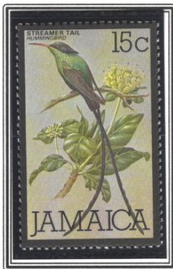
Jamaica's Arawaks Indians believe the "Doctor Bird" is the reincarnation of a dead soul.

Birds can have special place in a country's culture.