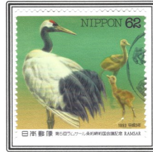
This issue marked the 5 th Anniversary of the Ramsar Treaty on the conservation of wetlands.

Birds can have special place in a country's culture.