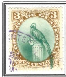
The Resplendent Quetzal also appears on Guatemala's coat of arms and banknotes