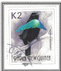
Papua New Guinea is home to 31 species of spectacular Birds-of-Paradise