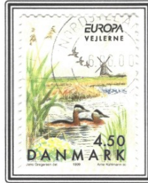
The theme for the 1999 Europa issue was Nature Conservation.