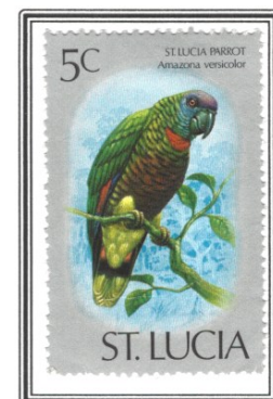
The St. Lucia Parrot is found only on St. Lucia. It nearly went extinct in the 1980s but popular support helped save it.