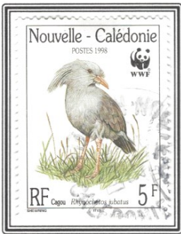
This WWF issue brought attention to the endangered Kagu, New Caledonia's National Bird.

Birds are used to promote the Conservation of Nature.