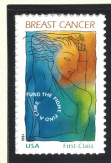
valley/peak (sub variety)